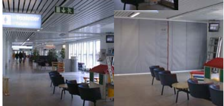
To provide open space, assist with way-finding and to comply with smoke compartment wall requirements in this building, Fiberseal was installed to operate as an automatic smoke wall.

The Fiberseal FS may be used in Fire Safety Engineered solutions to increase tenability conditions in basement car parks, underground train stations and other large compartments with relatively low ceiling heights for example or where it is impractical to provide mechanical smoke control measures.