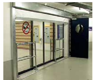
Fiberseal FS fire and smoke containment screen used to separate a carpark from a shopping centre to upgrade existing glazing system. The system has commenced deployment. See full deployment below.

Complementing the unique head box, smoke sealing system and bottom smoke gasket, is a patented labyrinth sealing system incorporated into the side guides.