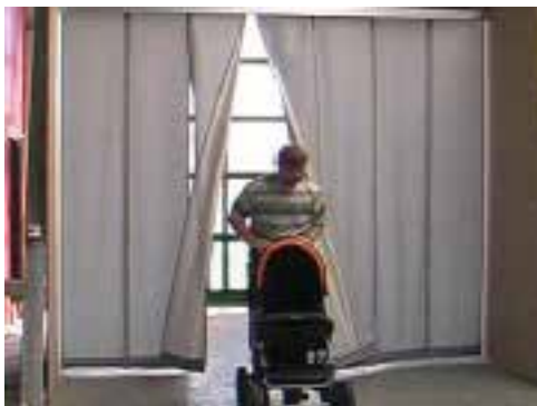
Providing safe passage for all levels of mobility