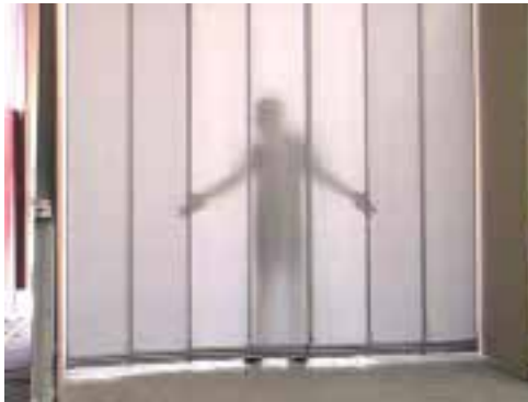
Light-optimized designs are advantageous for underground projects

This is especially advantageous for underground projects.