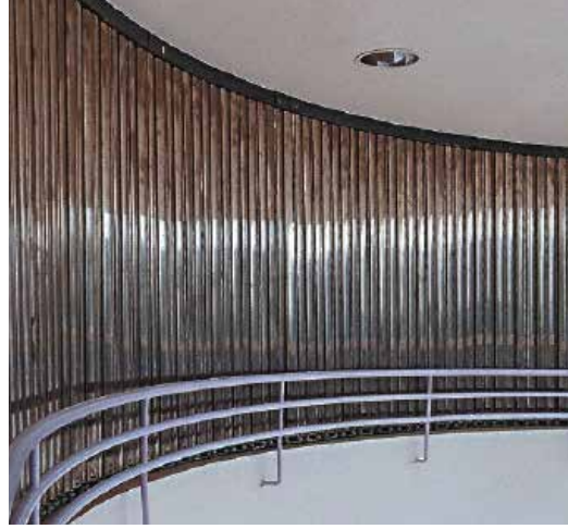
| Can be designed to curve and weave around a space.