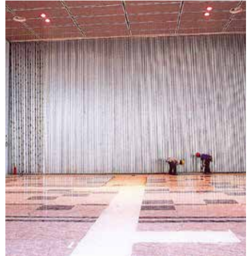
| The Metashield L can be specified for large installations

Smoke Control offers obligation free technical support throughout your design and documentation stage. We are also happy to provide obligation free pricing so that you can accurately prepare your budgets.